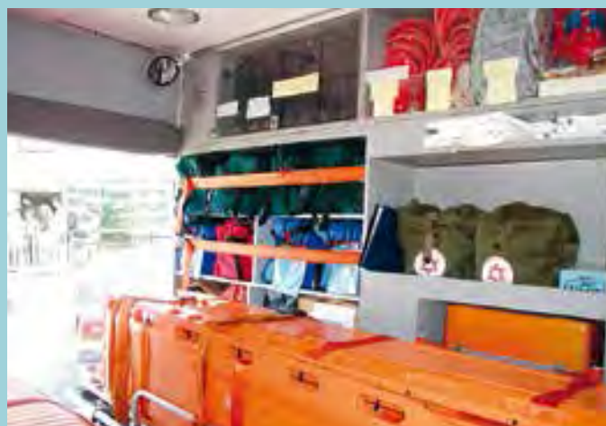
Equipment and supplies carried by the vehicle