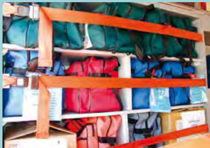
Equipment bags for emergency medical technicians and paramedics