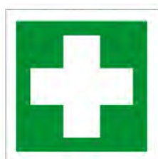
A widely used symbol for first aid

The Misión Médica symbol in Colombia, the sign for all health-care services in the country – created from Resolution 4481, which adopted the Manual de Misión Médica , or the Medical Services Manual . In Colombia, health-care personnel and facilities are collectively known as the misión médica or the ‘medical mission’. The manual is aimed at adopting and implementing a system to strengthen respect and protection for the medical mission in Colombia during armed conflict and in other situations of violence.