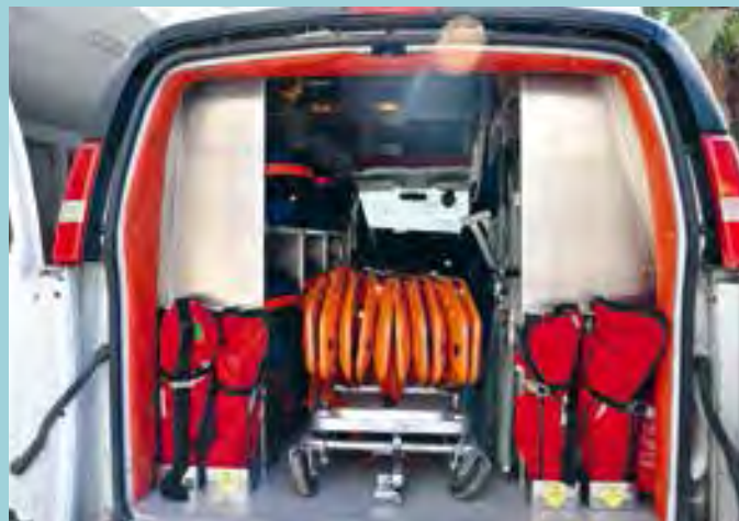
Spinal boards for moving people with suspected spinal injuries