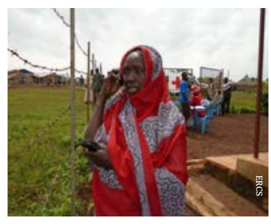
A South Sudanese refugee calling her family from a refugee camp in Assosa, Ethiopia, 2019.

The ICRC, in cooperation with the ERCS, strives to restore family links between family members separated by conflict, violence and migration through the tracing services of the Red Cross and Red Crescent Movement as well as through the provision of free phone calls and the exchange of Red Cross Messages (RCMs).