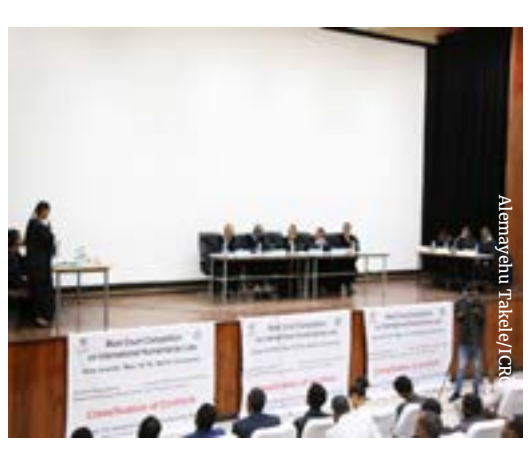
Finalists of the 4th National IHL (International Humanitarian Law) Moot Court Competition presenting their arguments before a panel of judges, Wollo University, Dessie Town, Amhara Region, 2019.