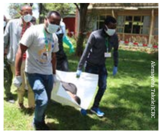
Red Cross volunteers transporting a causality from a fatality scene during a simulation exercise at a training on dead body management provided by ICRC and ERCS, Addis Ababa, 2019.

The ICRC works with local authorities to ensure that civilian residents, wounded and sick receive timely pre-hospital and hospital care during emergency in catchment area of ICRC-supported health facilities through provision of medical assistance.