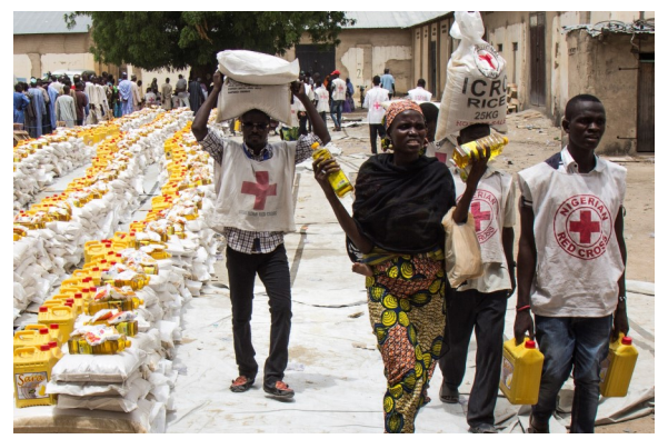
The ICRC assists IDPs in Maiduguri with food rations which helps to ease the discomfort of displacement

51 NRCS, NEMA and SEMA staff country-wide were trained in a humanitarian management program.