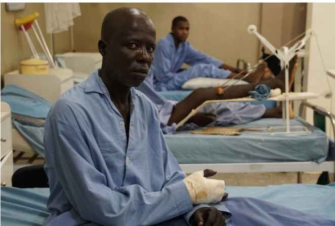
Weapon wounded patients recovering after surgery at the State Specialist Hospital, Maiduguri.

1,765 mainly weapon-wounded patients were treated by the ICRC surgical team in Maiduguri State Specialist Hospital, Borno, North East Nigeria, out of whom 415 were hospitalised.