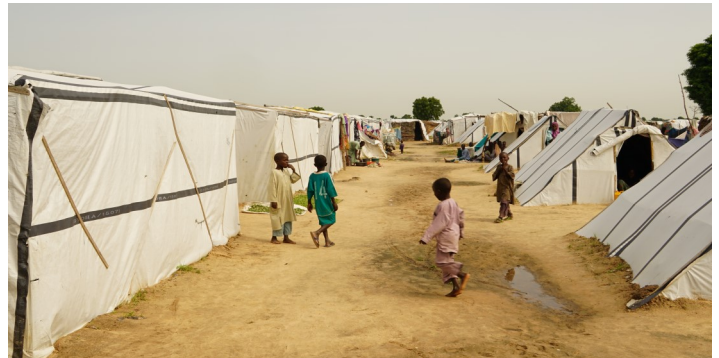
Muna Garage IDP camp, Maiduguri. Children play among temporary shelters provided by the ICRC.

The existing infrastructure, especially water and sanitation installations, too often breaks down under pressure from the increased population. In both IDP camps and most affected host communities the ICRC creates or upgrades water points and sanitation facilities, provides tents or builds emergency shelters. It also supports the NRCS and IDPs themselves to clean and maintain hygiene in the camps.