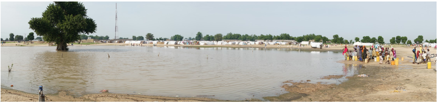
Residents of the Muna Garage IDP camp in Maiduguri fetch water from an ICRC provided water point.