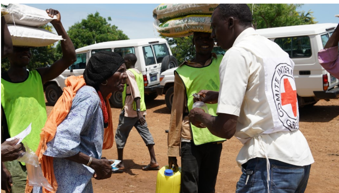
The ICRC assists IDPs in North Eastern Nigeria with food rations which helps to ease the discomfort of displacement.

1,000 widows/heads of households in Borno state, North East Nigeria, were registered to receive cash that will enable them to provide the basic necessities for their families, while an additional 250 received support for micro-economic initiatives. 220 widows/women heads of households living in urban shanty settlements in Niger Delta received training to enhance their capacity to start earning their livelihoods.