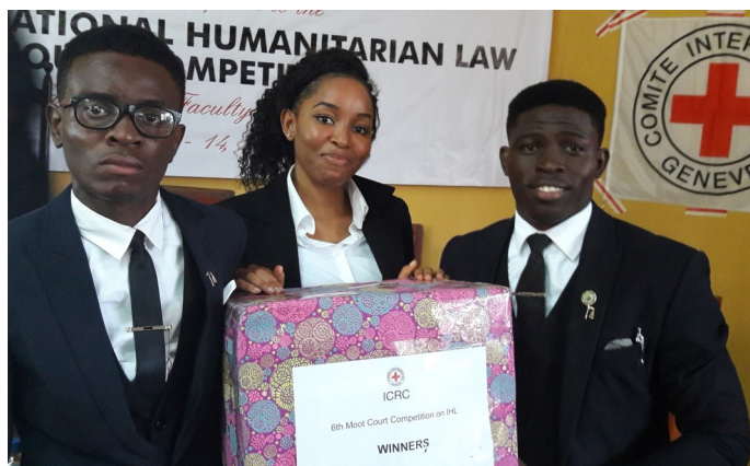
The winners of the 6th International Humanitarian Law Moot Court competition in Nigeria will represent Nigeria at the Africa finals in Arusha, Tanzania.

The ICRC worked with academics, think-tanks and over 600 students from 24 Nigerian universities, in order to enhance the teaching of IHL in Nigeria.