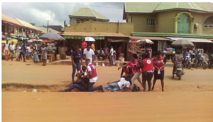
With the support of the ICRC, the NRCS conducts emergency first aid training in Asaba, Delta State.

The ICRC supports the NRCS and its country-wide network of volunteers to ensure that persons affected by armed conflict and violence are assisted as quickly and effectively as possible. The ICRC enhanced the operational capacity of the NRCS