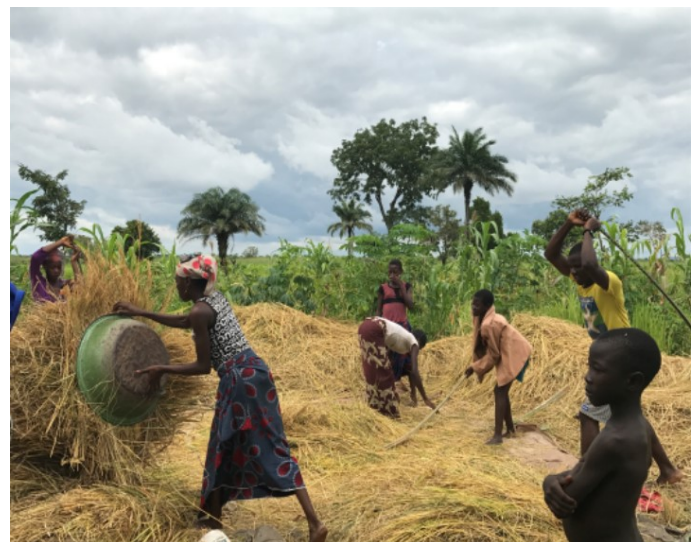
They received improved seeds to plant their fields barren by the communal violence in Benue state. Thanks to the good quality seed and good rainfall, the harvest turned out well.

More than 130,500 people, including widows, received cash and basic training on small businesses to help them start a sustainable livelihood. In addition, 17,620 persons received repeated cash assistance to cover their most pressing needs.