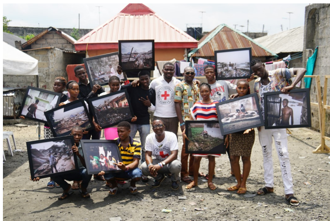
In a Port Harcourt's community which we assisted in building resilience and coping with armed violence, we gave cameras to teenagers who documented their lives.

The ICRC has had a permanent presence in Nigeria since 1988. Its main office is in Abuja, with seven additional offices in the field to maintain the organisation's proximity to people affected by armed conflict or violence, to understand their needs, and to respond appropriately. At the end of 2017, 640 national and international staff were working for the ICRC in Nigeria in 12 different locations.