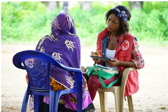
The ICRC trained 3,000 NRCS staff and volunteers on how to assess the needs of communities displaced by the armed conflict or other situations of violence. Community representatives help design our humanitarian response.