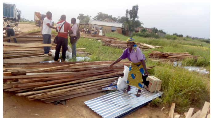
After receiving building material to rebuild her home destroyed during communal clashes in Kaduna, this lady rewarded us with a dance.