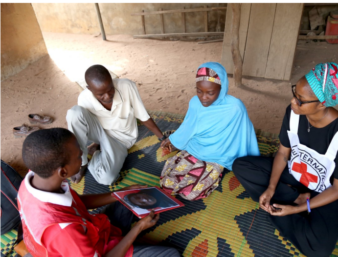
After searching for many months, the Red Cross found Ima's mother, and could show Ima her picture. They were reunited, after being separated for four years.

1,700 free phone calls were made available by the Red Cross to persons searching for their family.