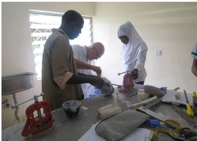
ICRC surgical center in Kano, functioning since 2016, enhances mobility of people who have lost limbs as a result of the conflict.

More than 230 Nigerian doctors and nurses improved their skills in emergency trauma and surgical management of the wounded from courses organized by the ICRC.