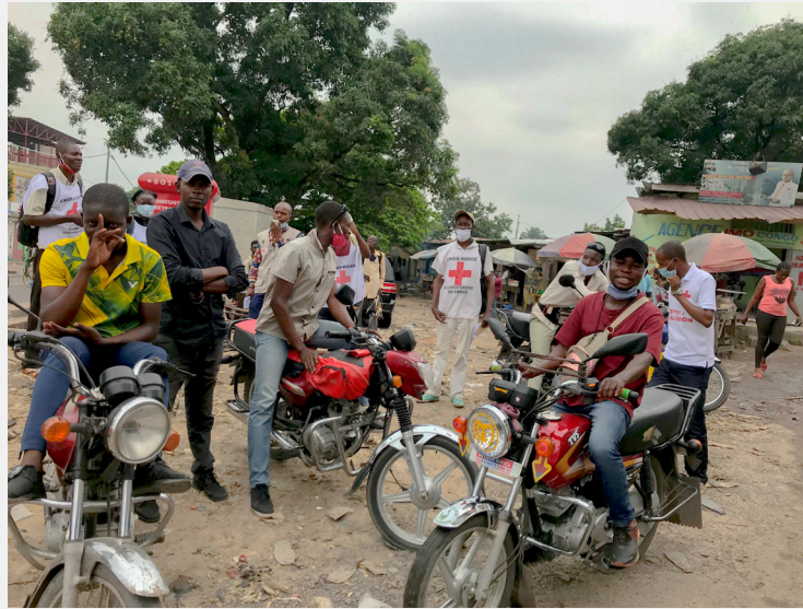
Biker awareness session in Kinshasa