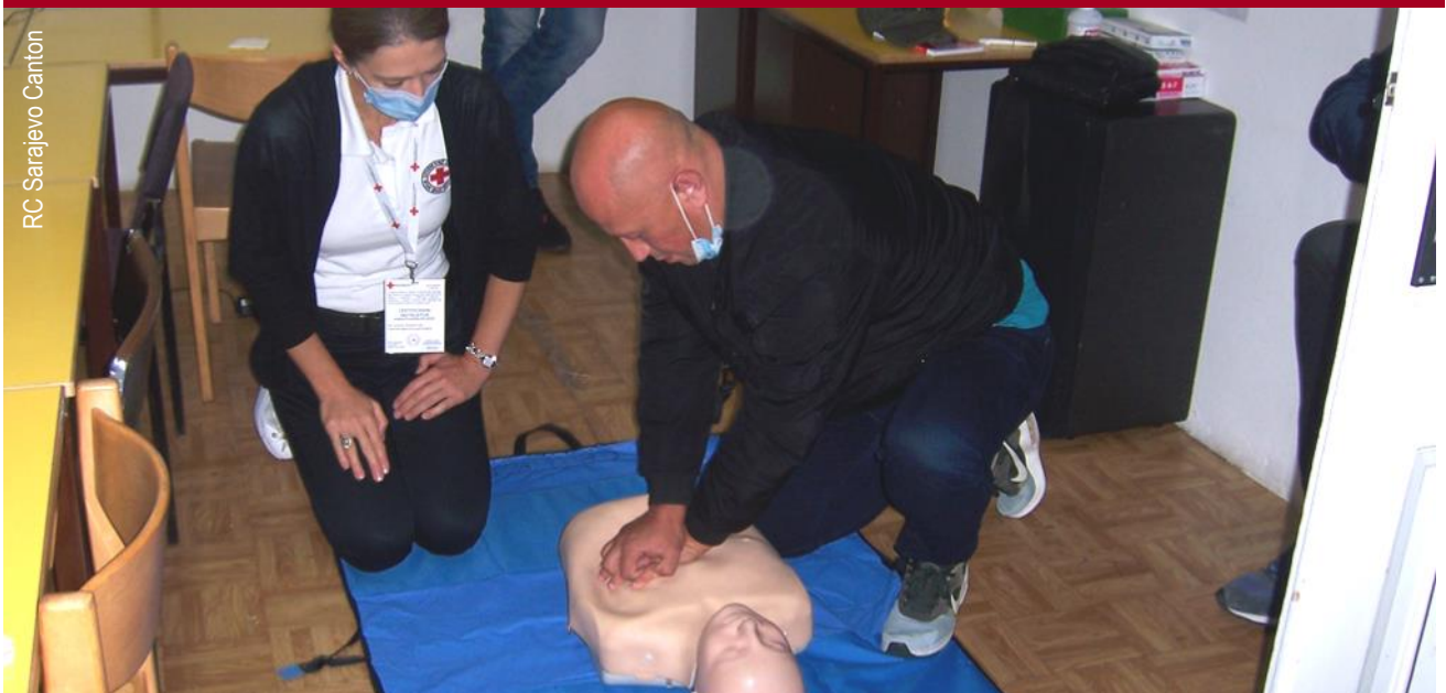
RC Sarajevo Canton

In 2021 and 2022, nearly 2,000 police officers from Una-Sana and Sarajevo cantons completed Red Cross first-aid training.