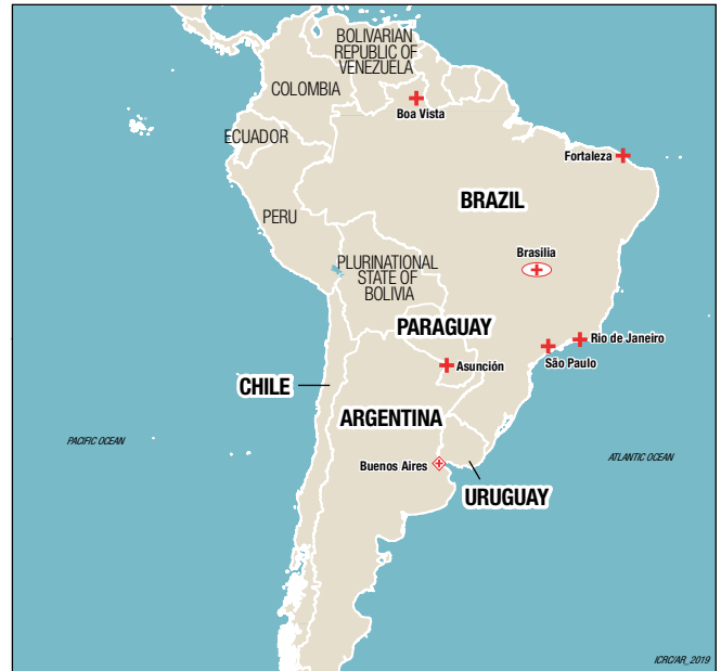
⊕ ICRC regional delegation ⊕ ICRC sub-delegation ◆ ICRC mission + ICRC office/presence