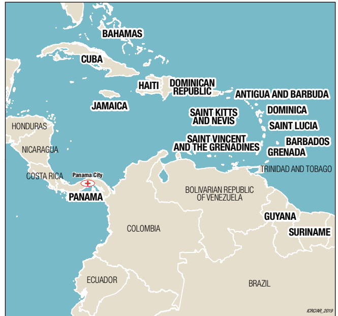
ICRC regional delegation

Having worked intermittently in Panama since 1989, the ICRC has had a stable presence in the country since 2010. In 2019, it opened a regional delegation in Panama City. The delegation aims to raise awareness of and mobilize support for humanitarian principles, IHL and the ICRC’s activities through regular contact with representatives of multilateral and international organizations, governments and the military and police forces. The ICRC helps build the capacities of the region’s National Societies in responding to humanitarian concerns of vulnerable migrants and violence-affected people. It monitors the treatment and living conditions of detainees.