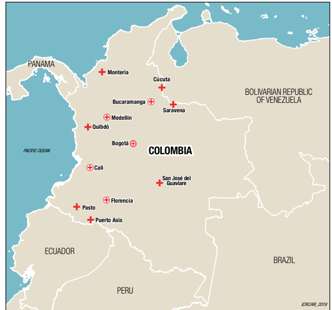
⊕ ICRC delegation ⊕ ICRC sub-delegation ⊕ ICRC office/presence